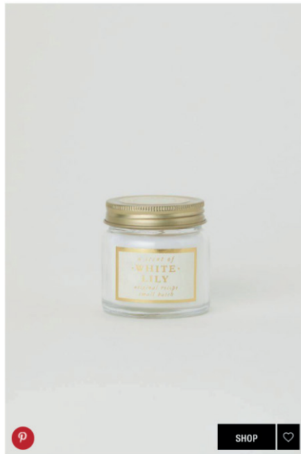
H&M Scented Candle in Glass Holder ($3)

This affordable H&M candle smells like pleasant white lilies. I think three of these in a row would look so cute on a tabletop.