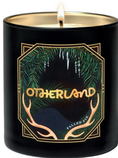
Otherland Gilded Fallen Fir Scented Holiday Candle ($36)

This affordable H&M candle smells like pleasant white lilies. I think three of these in a row would look so cute on a tabletop.