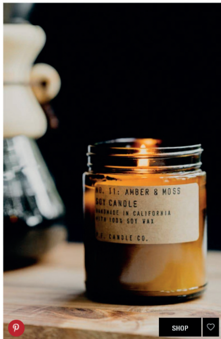
P.F. Candle Co. Soy Candle in Amber and Moss ($20)

I'm a sucker for any and all winter-themed candles that remind me of the holiday season—no matter how cheesy they may be. Give me all of your scents of pine, fir, amber, mulled wine, vanilla, spices, eucalyptus, and more, and I'll be one happy camper (minus the need to actually go camping in the woods). Scroll down to shop my favorite winter candles of all time.