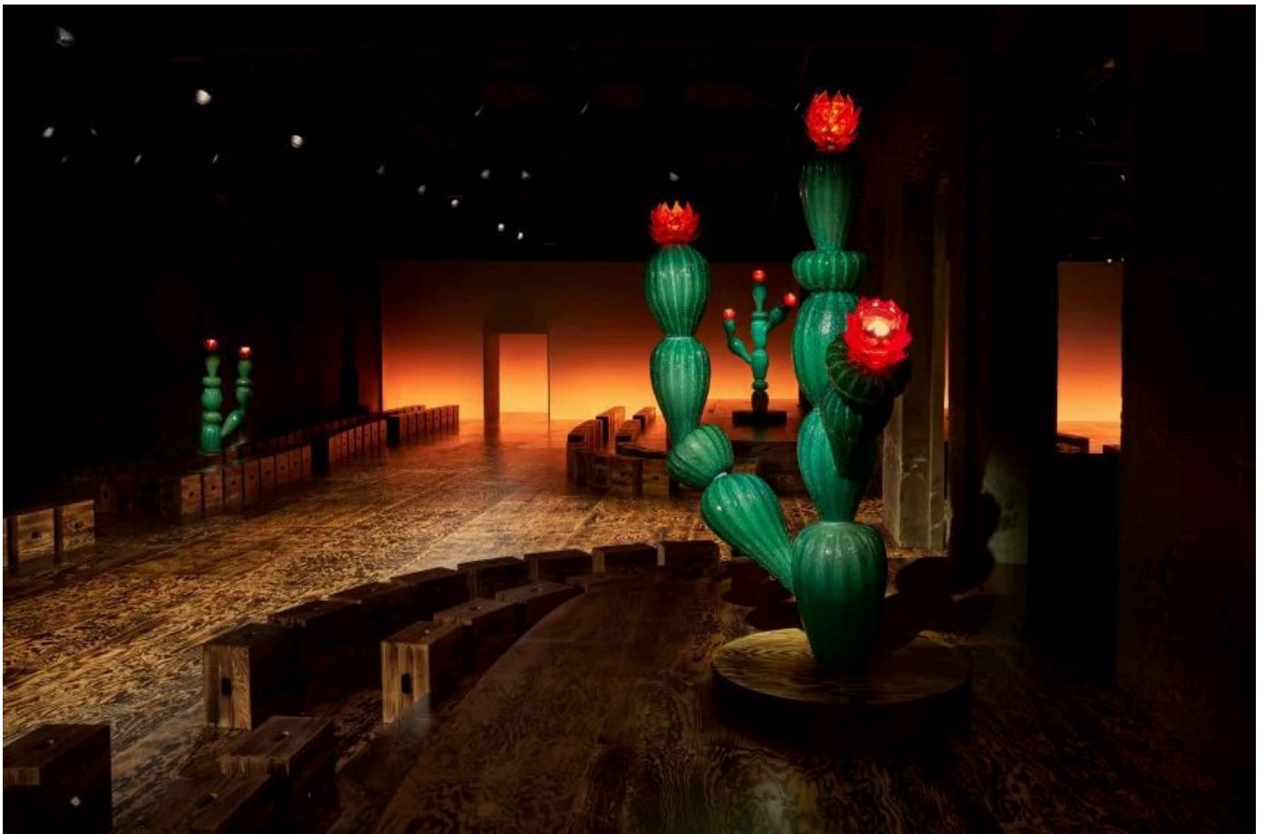
Giant flowering cacti were made from Murano glass

"The floor is fired, the box stool is fired, the Murano glass cactus is fired," he added. "The cactus grows where nothing else can grow."