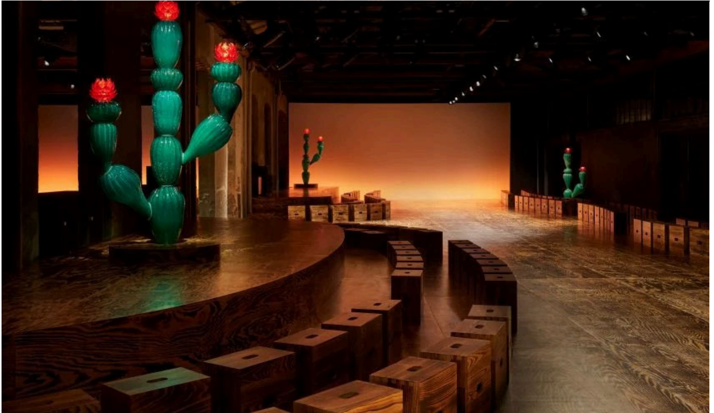
The floor and the stools were scorched with the same technique

Placed around the scorched-wood show space were giant flowering cacti sculptures made from Murano glass.