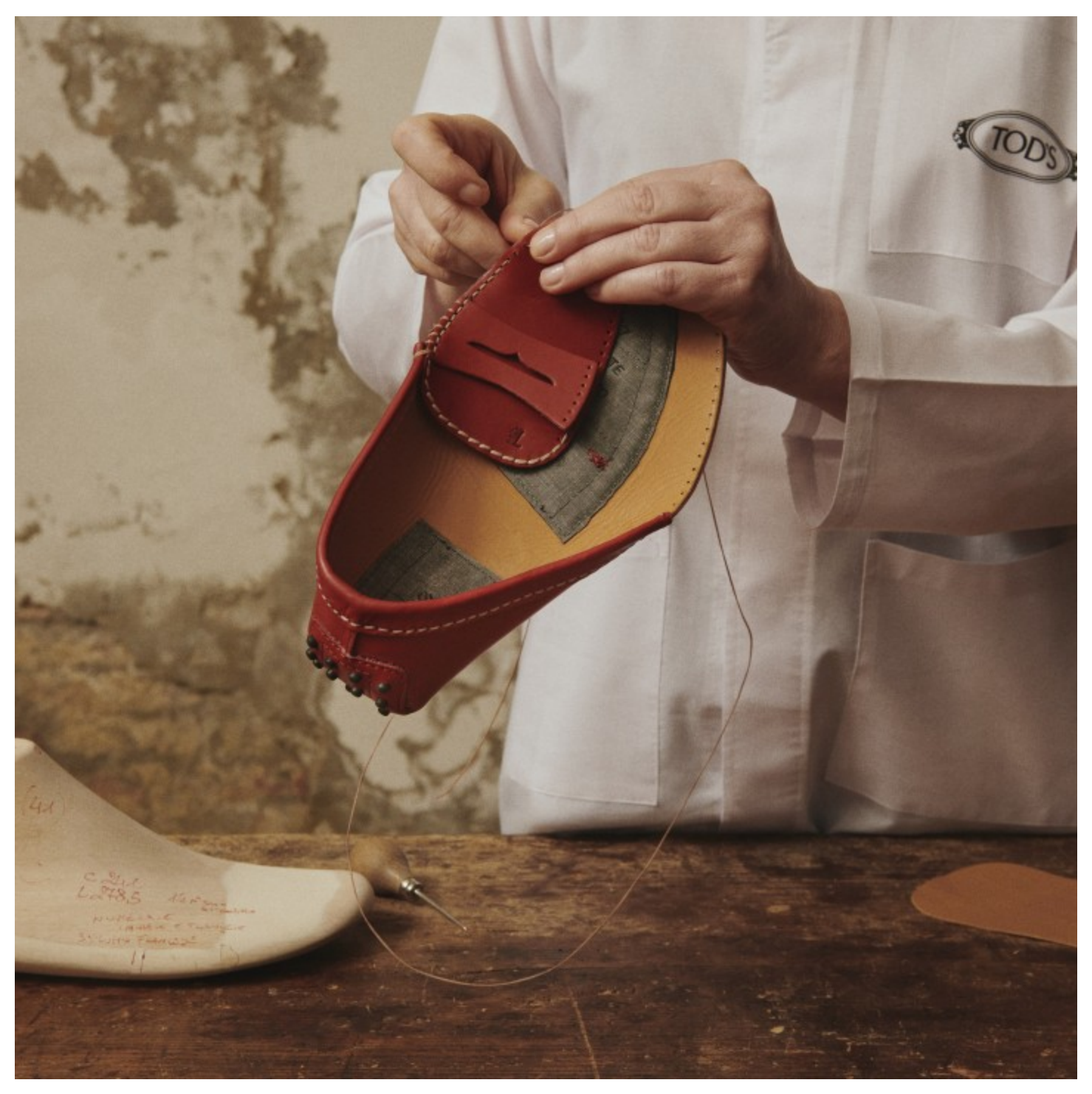
Tod's latest exhibition showed its unwavering support for Italian artistry, featuring craftsmen including glass artists and gold-leaf beaters, and nodding to the brand's iconic Gommino shoe.